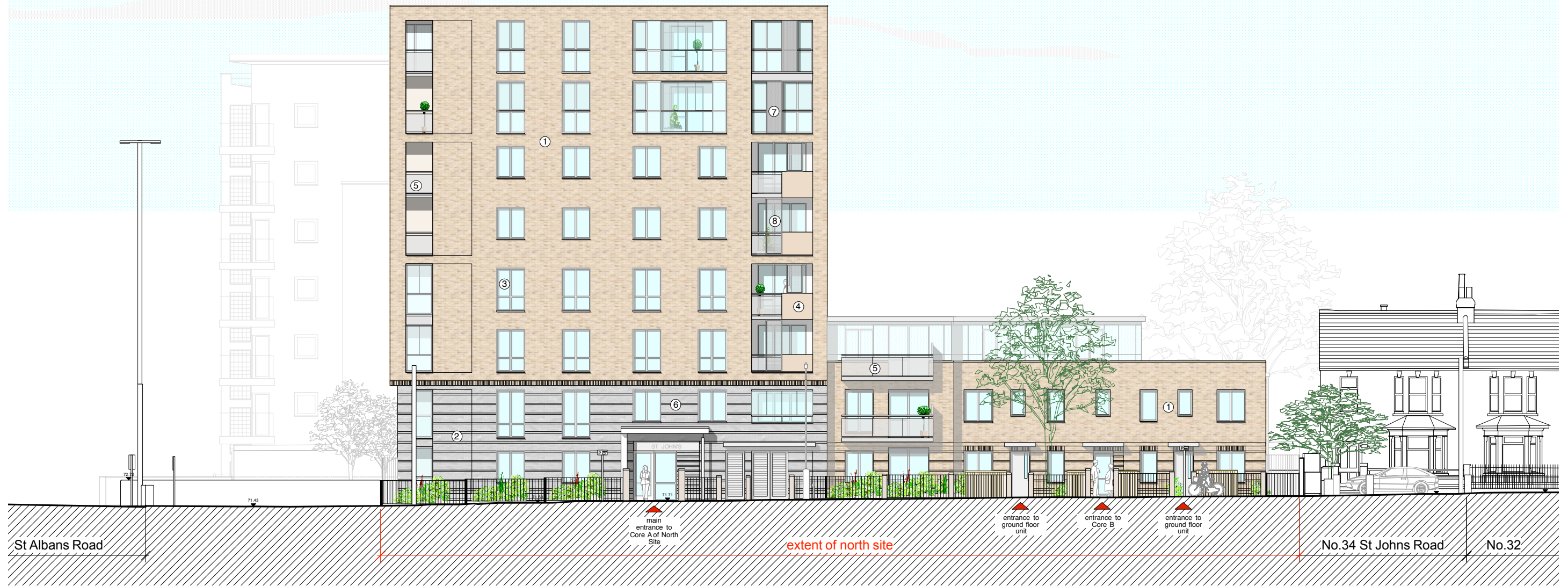
Proposed South Elevation: North Site (St Johns Road)